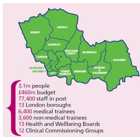
Figure 1.3: The HE NCEL geographical area

The HE NCEL geographical area is large and encompasses a population of 3.1 million people from a range of socio economic statuses; there is expected to be a growth of 21% in the population of those under 15 years of age by 2021 (HE NCEL, 2013b), this reinforces the need to consider the educational needs of the workforce who will be meeting the health needs of this sector in relation to out of hospital services.