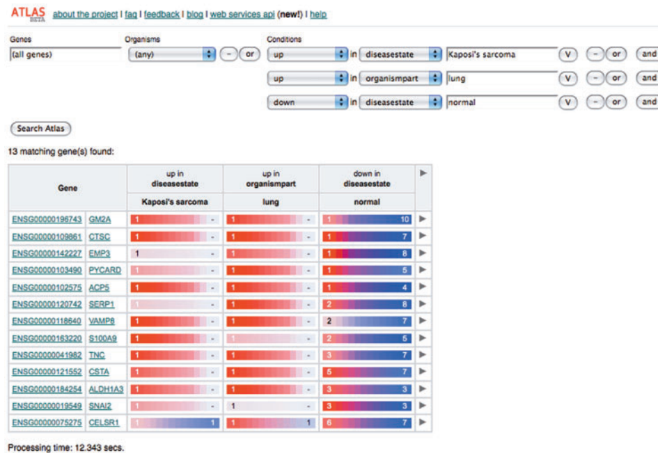
Figure 3. ArrayExpress Atlas advanced query interface showing all genes up-regulated in Kaposi's sarcoma diseased lung tissue and down-regulated in normal samples.

cell (Figure 3). More complex queries combining several conditions are available via the advanced Atlas interface.