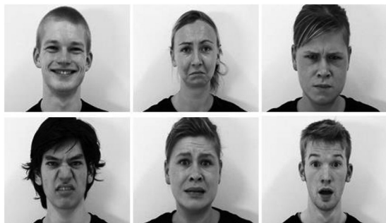
Figure 1. Real human face stimuli displaying prototypical emotions (from top left to right) happiness, sadness, anger, disgust, fear and surprise.

Participants were tested individually and seated in front of a computer screen. They were asked to categorise the emotions presented as happiness, sadness, anger, disgust, fear or surprise. In order to ensure that participants understood the test instructions, three training trials with feedback preceded the test trials. The test consisted of two blocks (one static and one dynamic) each containing 30 trials, showing five of each of the six emotions. The order in which the trials were presented was randomised across the children and the order of presentation (static or dynamic) was counterbalanced. Each stimulus was presented on the screen one at a time in a random order. The videos lasted for five seconds