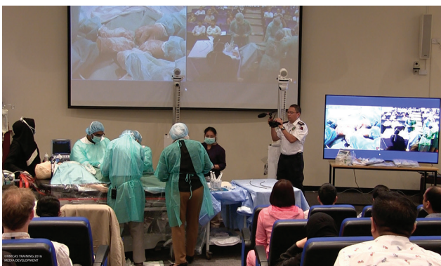
Fig. 3 Demonstration of the full venovenous ECMO cannulation procedure during a respiratory ECMO course held in Doha, Qatar.

an ECMO cannulation demonstration in front of a large audience of learners, whereas (► Fig. 4) shows a multiprofessional team of clinicians taking part in an in situ scenario during which they had to recognize the circuit failure and proceed with the circuit change.