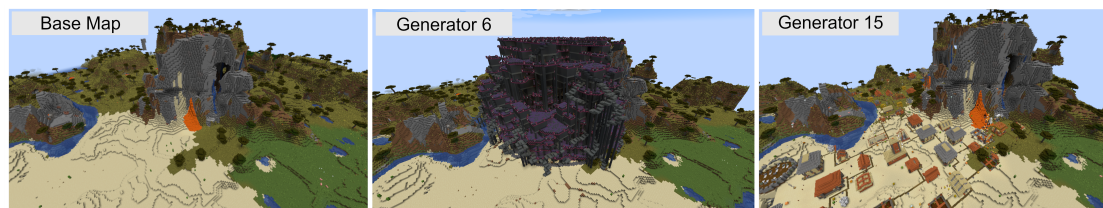
Figure 1: Visualisations of the Two Maps Selected for Examination from the 2021 GDMC. Generator 6 with the Highest Overall Aesthetic Score and Generator 15 Being the Overall Winner