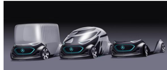
Figure 2. Vision Urbanetic concept © Daimler.