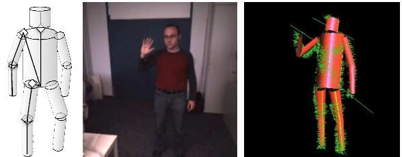
Fig. 1. Human body model and motion capture example

For the proposed approach, a human motion capture system gathers data of the human configuration over time, resulting in trajectories for each modelled limb and joint angle of the human body in 3d. The motion capture system called VooDoo is described in detail in [10], [11]. The used body model and an example configuration are shown in fig. 1.