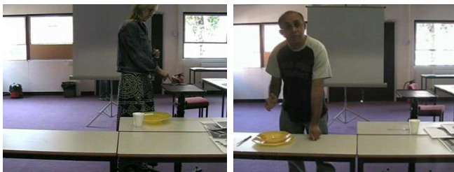
Fig. 3. Examples from the first study – Left: Subject pointing, Right: subject pointing with left hand to general target locus for group of objects and at the same time showing position relative to other objects with the right hand which mimes object transport.

Co-occurrences of gestures was also investigated. The aforementioned issues with intercoder agreement made this difficult. In the included results, mainly one of the participants displayed multiple co-occurrences, which mostly consisted object referencing at the same time as transportation. However, Fig. 3 (right) shows an example of co-occurrence taken from the first user study: the subject is showing the target location to place the fork with his left hand and, at the same time, the right hand is showing that the location is relative to the position of the plate. In this case, the gesture was coded as pointing and miming transportation.