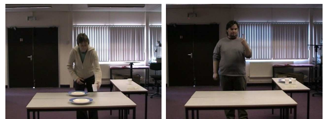
Fig. 4. Examples from the second study: Manipulative gesture - grasping a cup (left), symbolic gesture - index finger raised introducing the FIRST STEP (right)

lies under 2 seconds in both conditions. For the manipulative category, however, this is not the case. For this category the majority of time intervals lies above 3 seconds. The same pattern is confirmed by the durations reported in table IV. For all categories apart from manipulative, the mean duration was below 2 seconds. For manipulative gestures, the mean for both conditions was 3.3 seconds.