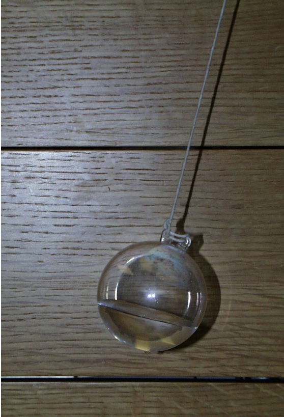
Figure 1: The water level in an oscillating pendulum

One of the nice benefits of these ‘kitchen sink’ experiments is that the students tend to look on them as open fresh territory. We suggest a contrast with a traditional physics experiment that has attached to it a very concrete outcome. Students are honed in to those observables that lead them to the answer. They are accordingly less likely to observe the general nature of the phenomenon in hand. A nice example to illustrate this uses the acrylic sphere again. Partially filled with water, the sphere is suspended from a wound rubber band and released. The rise of the fluid surface up the sphere is impressive, and students can watch to see how the fluid surface changes shape and note the propagation of small surface waves as the spin speed and direction change during the oscillation. So we find that investigating the effects of changing rotation, and the unusual shape of the vessel, can give renewed life to the classical problem of a cylinder of fluid in uniform rotation.