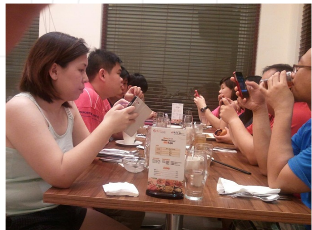
Figure 2. Singapore, a scene before starting the dinner in a restaurant

eventually up to humans to decide whether the work is of any worth. Will robots be able to think creatively? As creative thinking is considered to be an essential part of generating culture, it remains a topic for further discussion.