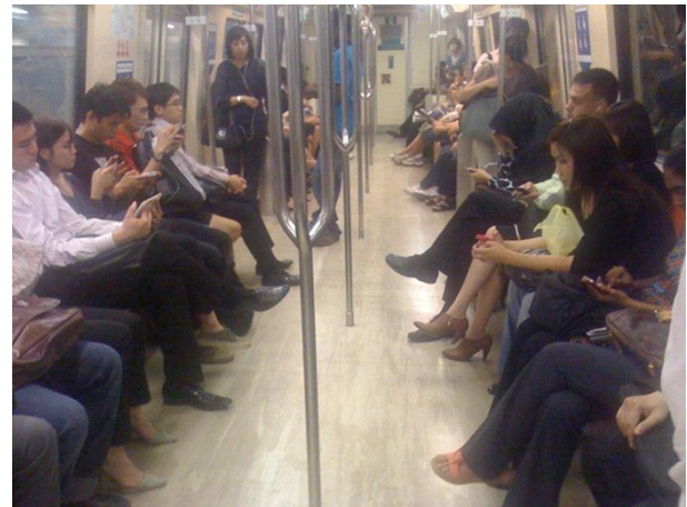
Figure 1. Public train in Singapore. Almost every person is busy with a smart device.

Another claim against the possibility of robot culture is the limitation of creativity. Creativity involves the ability to think critically. Goldenburg in his book "Creativity in Product Innovation" [67] claims that suspending criticism and thinking that any idea is possible or good may ultimately be destructive to creativity. Humans have the ability to criticize themselves, whereas robots cannot. Even though machines can write music and poetry [68] it is