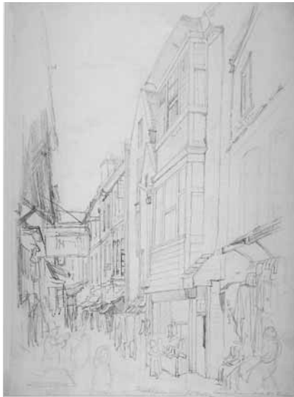
Figure 1.02 Field Lane, c. 1800.

While passers-by provided vital assistance in arresting those suspected of crime, typically they did so at the request of the victims, who normally provided the key prosecution evidence at the subsequent trial. But who was to provide the lead in the arrest and prosecution of those accused of victimless crimes such as sodomy? For the prosecution of this type of crime the English judicial system relied on informers, men who, for financial or other reasons, deliberately sought out offenders and brought them before the court. Such men were often reviled for profiting from the misery of others, and were believed to be, and often were, corrupt. But when their activities resulted in the prosecution of deeply unpopular groups such as homosexual men, they received a sympathetic hearing at the Old Bailey.