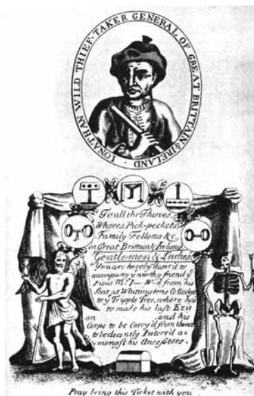
Figure 1.03 A 'Ticket' to Jonathan Wild's Hanging (1725)

formed the basis for the odious 'Peachum' in John Gay's Beggars Opera (1728). 12