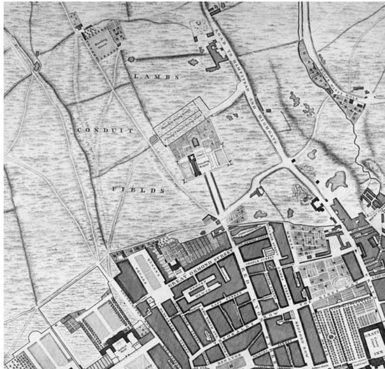
Figure 1.01 Lamb's Conduit Fields, from John Rocque's 1746 Map of London.