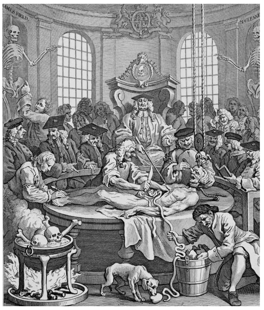
Figure 5.02 'The Reward of Cruelty', plate iv of 'The Four Stages of Cruelty', by William Hogarth (1751).

Another witness recalled a rather less polite exchange: