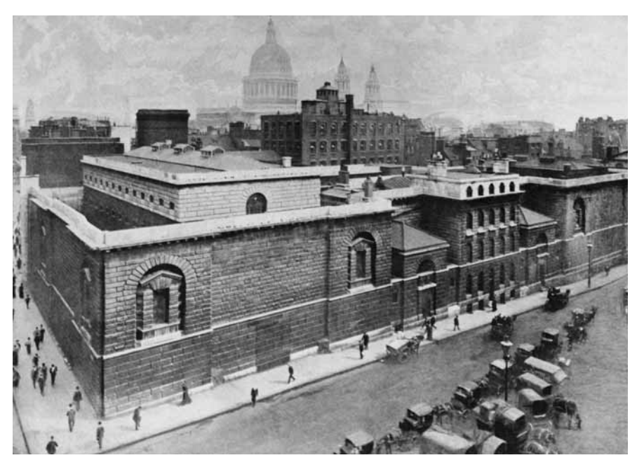
Figure 5.05 Newgate Prison, rebuilt 1780–83.

Rather than alcohol, Pitt had discovered a complete set of tools calculated to engineer an escape from Newgate, despite the prison's formidable construction. As Pitt explained: