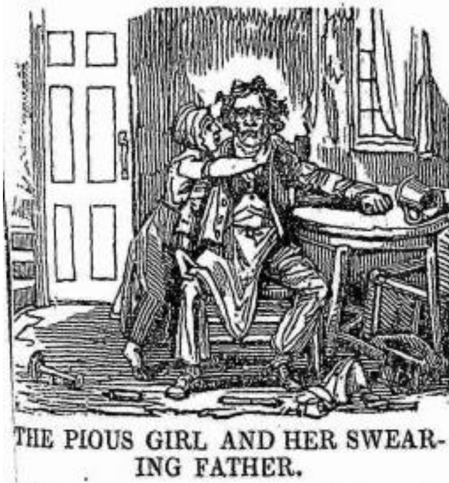
Fig. 5 An illustration of a child reproving her father for swearing, from The Child's Companion; or, Infant Scholar's Reward (January 1827)

security and domestic comfort. 165 For example, reformed fathers bought food and clothing for their children with the wages that they had previously squandered on drink.