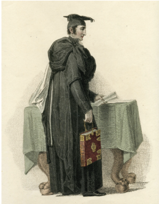
From 'A Purple Passion?' pp. 63–71: Fig. 8, Cambridge Proctor, above, wearing the ruff under his hood in 1815. Top: Fig. 9, Tyrian purple.