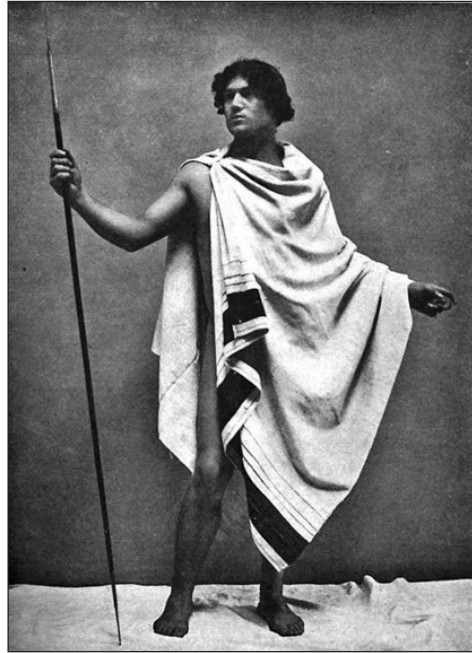
FIGS 1, 2. Two pictures of a chlamys , showing movement of the clasp.

below the pallium . If the higher layer is preferred for the pallium , then a better translation might be 'cloak' or 'mantle'.