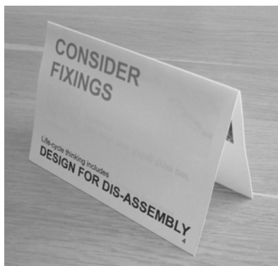
Figure 2 Format of Card

A Slogan was selected for the front which gave an overview of ambition and an explanation of possibilities. Inside were details of differing approaches to the slogan. The category slogans are issues which designers influence and understand rather than an 'objectives list' from an ecologist's perspective. The reasoning behind the selection of these categories is simply that they make sense to designers, create a framework for eco possibilities and are manageable in that no pack has more than eight cards.