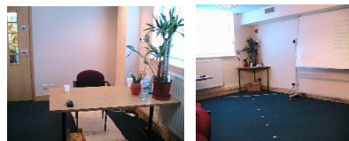
Fig. 1 Simulated living room for the human-robot interaction trials

involved the robot moving in the room (either with a Socially Ignorant or Socially Interactive behaviour style) while the subject went through a pile of books placed on a table, remembering one title at a time, walking over and writing down each title on the whiteboard. The Assistance Task involved the subject sitting at a table copying book titles from a whiteboard onto a piece of paper and underlining specific letters with a red/highlighter pen. The robot was responsible for bringing the missing red/highlighter pen to the table. The two tasks were chosen as they match the two key scenarios studied in the Cogniron project. At the end of these two tasks, the subject completed a robot personality questionnaire. The main trial was then repeated with the alternate robot behaviour style. Trials lasted for approximately one hour.