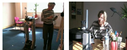
Fig 2. The negotiated space (left) and assistance task in the robot trials.